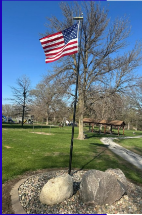
American flag at Edgington Park in Avoca